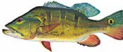
Butterfly Peacock Bass